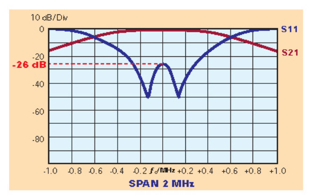
Typical shape of a curves for S11 and S12 parameters for single filter