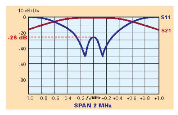
Typical shape of a curves for S11 and S12 parameters for single filter