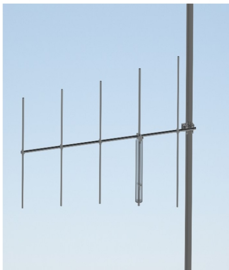
RADOME OPTIONAL VERSION