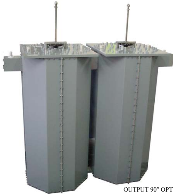
OUTPUT 90° OPTION

THESE ARE TWO STANDARD RESONANT CAVITY FILTERS, AND IN SPECIAL VERSION WITH 3 AND 4.